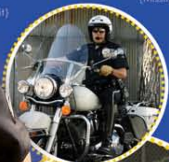
{Missing Persons Unit}